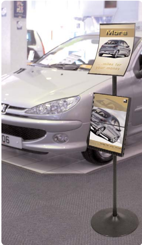
Observe Lite shown with brochure holder & curved header (A4 Portrait)

A versatile, lightweight push together design featuring an adjustable brochure holder and a curved header that may be converted to a larger format sign holder. Observe Lite is ideal for product promotion and point of sale displays as well as conferences and seminars