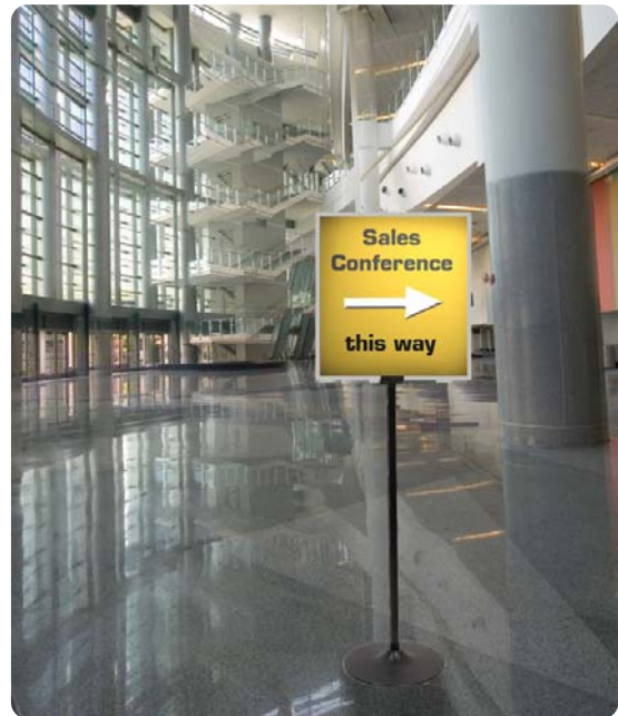
Observe Lite shown with Poster holder fitting